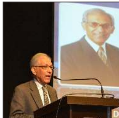
Mr. Salman Haider Former Indian High Commissioner to UK and London

IMS Ghaziabad, University Courses Campus organized IMS Model United Nation Conference (IMSMUNC) from 16th-17th December, 2016. It was an extraordinary intellectual and social conference that brought together an amazing assortment of young minds to engage in cultural exchange and gain firsthand experience of negotiation. The delegates from different schools and Universities acted as UN representatives and debated on international issues. Mr. Salman Haider, Former Indian High Commissioner to UK and London , presided as the Chief Guest of the event.