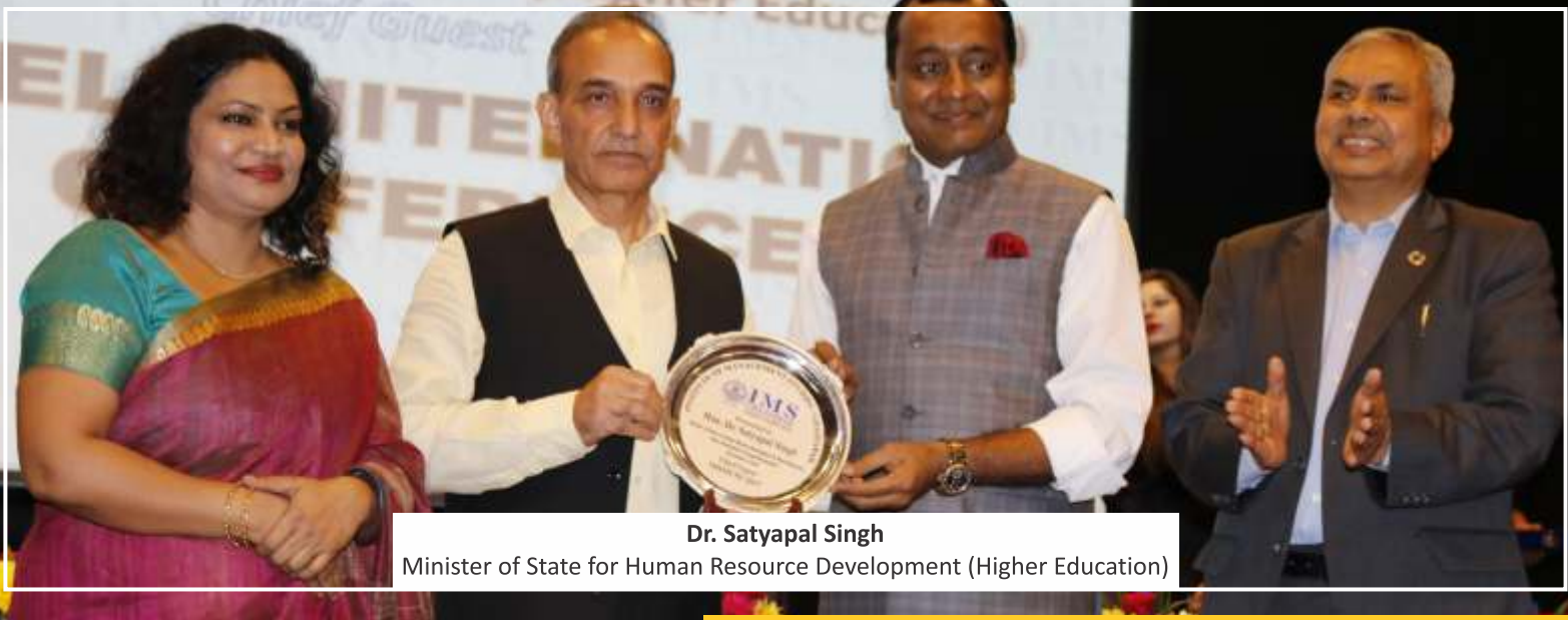
Dr. Satyapal Singh Minister of State for Human Resource Development (Higher Education)