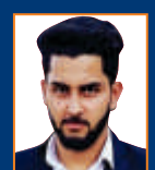
Rajat Sharma Tommy Hilfiger