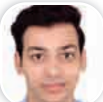
MIB (Batch: 2017-19)

IMS is a place that provided wings to my passion, exposure to unexplored terrain and intellect. Faculty always motivated and helped me in excelling at academics and I secured top rank at University level. I must say IMS is an institution which is an amalgamation of knowledge and learning while preparing for life goals. I am grateful to director sir, my mentors and faculties for shaping my future.